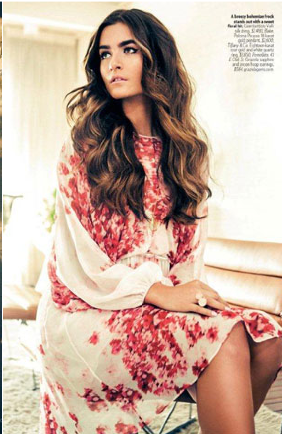
A heavy influence from stands out with a sweet Rosalba, Guaymas, Vall de Arona, $2,495. Rose Patrona, Patrona 18-karat gold pendant, $2,600. Tiffany & Co. Lightroom-karat rose gold and white-quartz ring, $2,850. Pandora 41 L'Orléans, Grande, sapphire and moonstone earrings, $284. paroligems.com