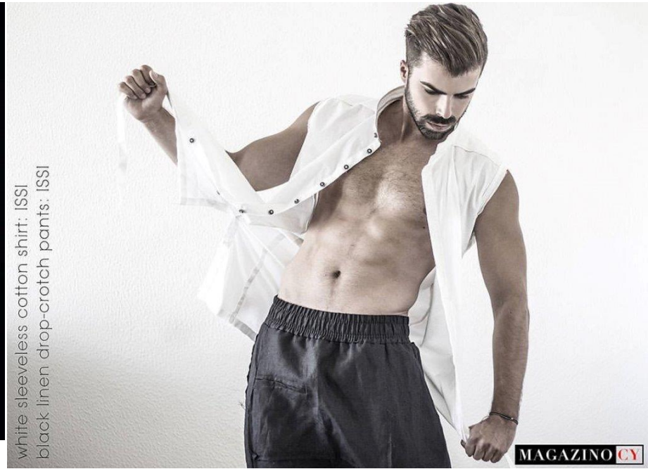
white sleeveless cotton shirt: ISSI black linen drop-crotch pants: ISSI